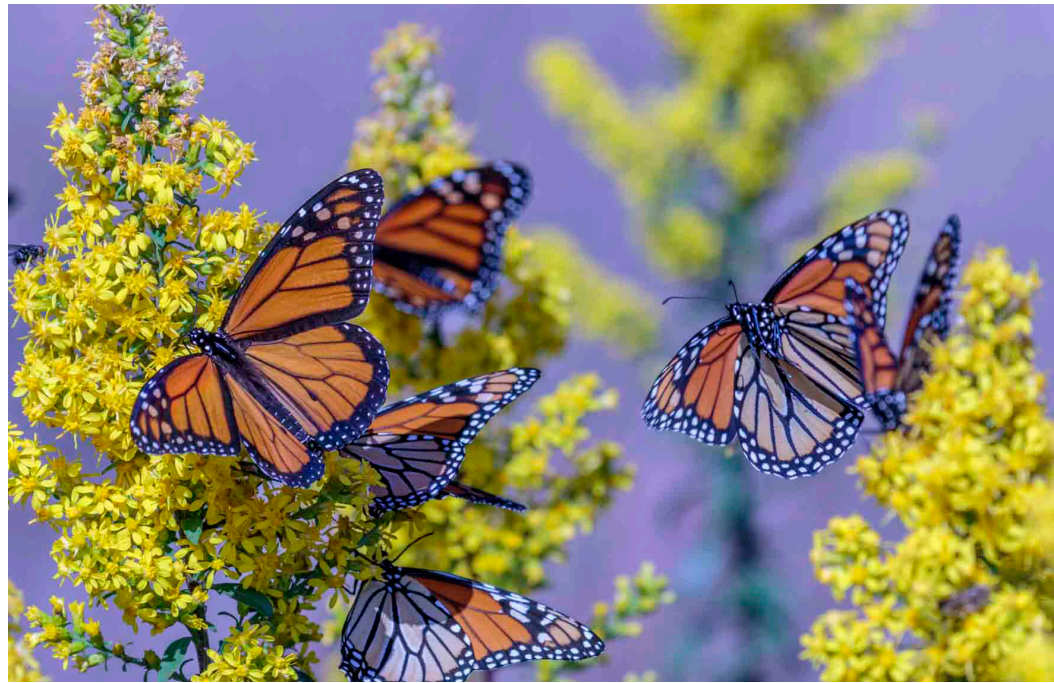
Monarch butterfly photo courtesy of Bruce Bartel.

Landowners interested in learning about cost-sharing opportunities for pollinator projects on their lands should check with their local natural resources conservation service or U.S. Fish and Wildlife Service private lands biologist.