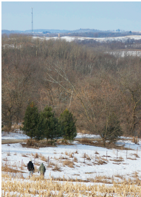
Bruce and Nancy learned about permanent land protection while attending a Conservancy volunteer day. They share their conserved land with many native wildlife species.

the woods, including one trail that Bruce created with the input of an expert who helped him design it to resist erosion. The trail terminates at a huge oak that the children have named "the grandfather oak."